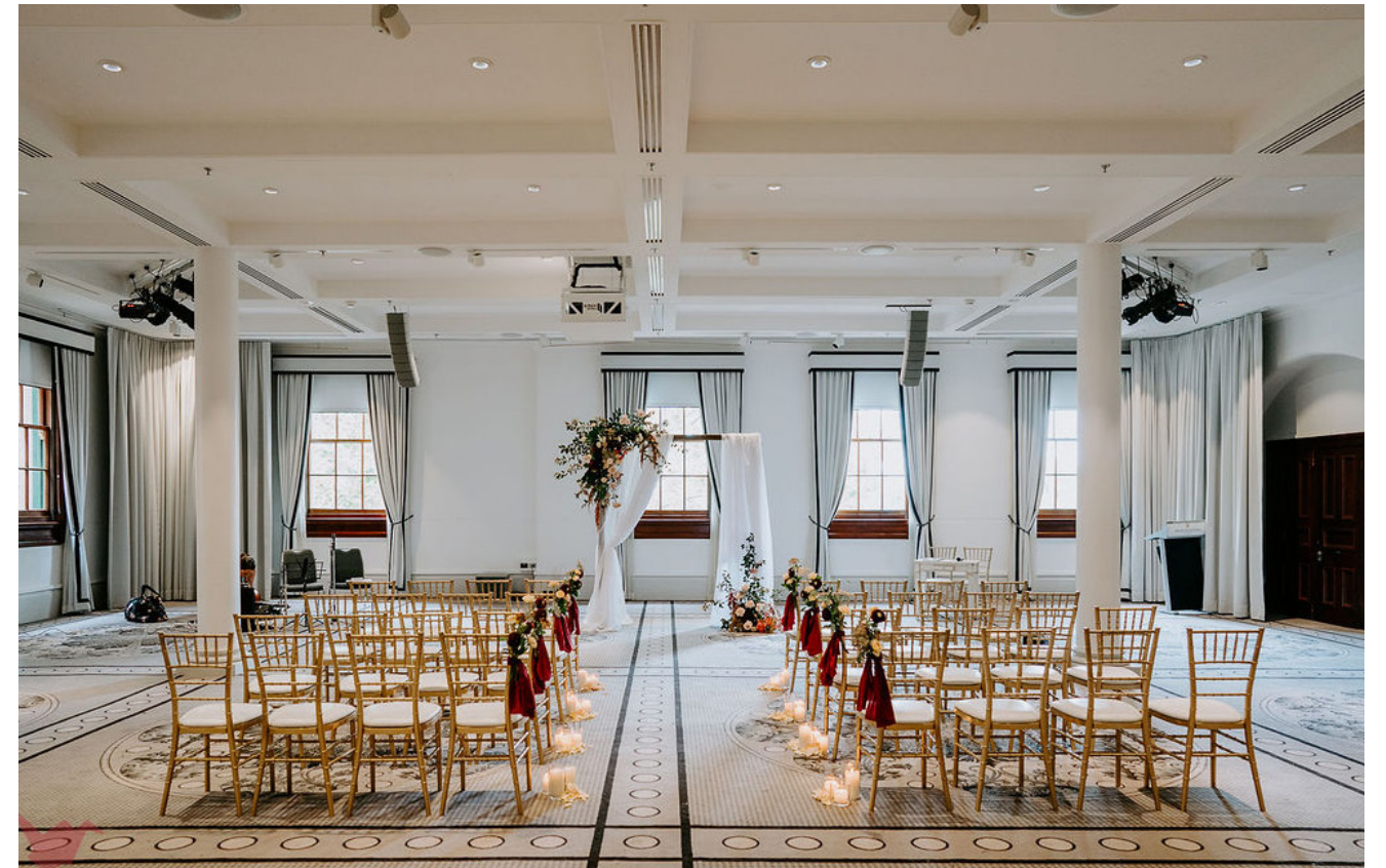
Fort Macquarie Room