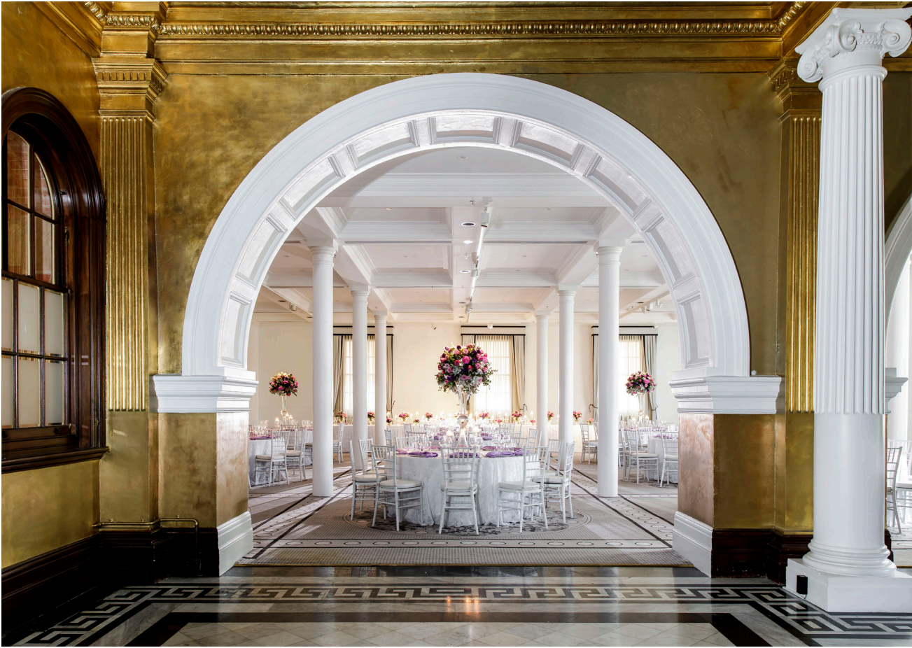
The Treasury Room

Please note, this package has been designed for a maximum of 100 guests. A $15 surcharge per person will be applicable for ceremonies over 100 guests.